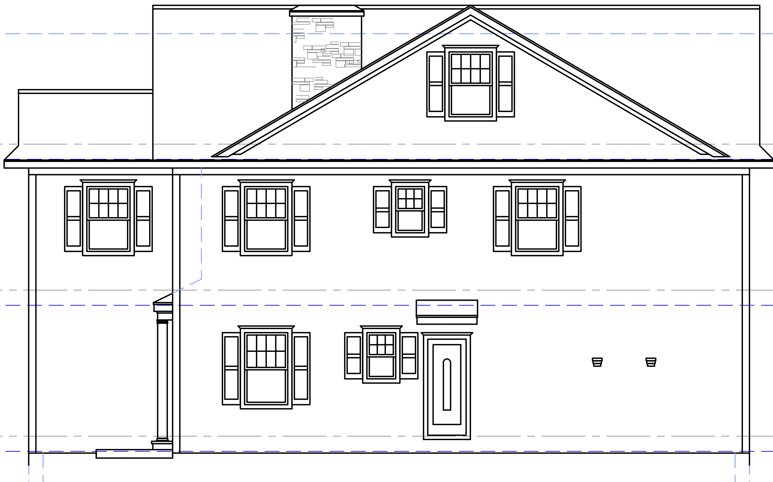
3 EAST SIDE ELEVATION SCALE: 1/4" = 1'-0"