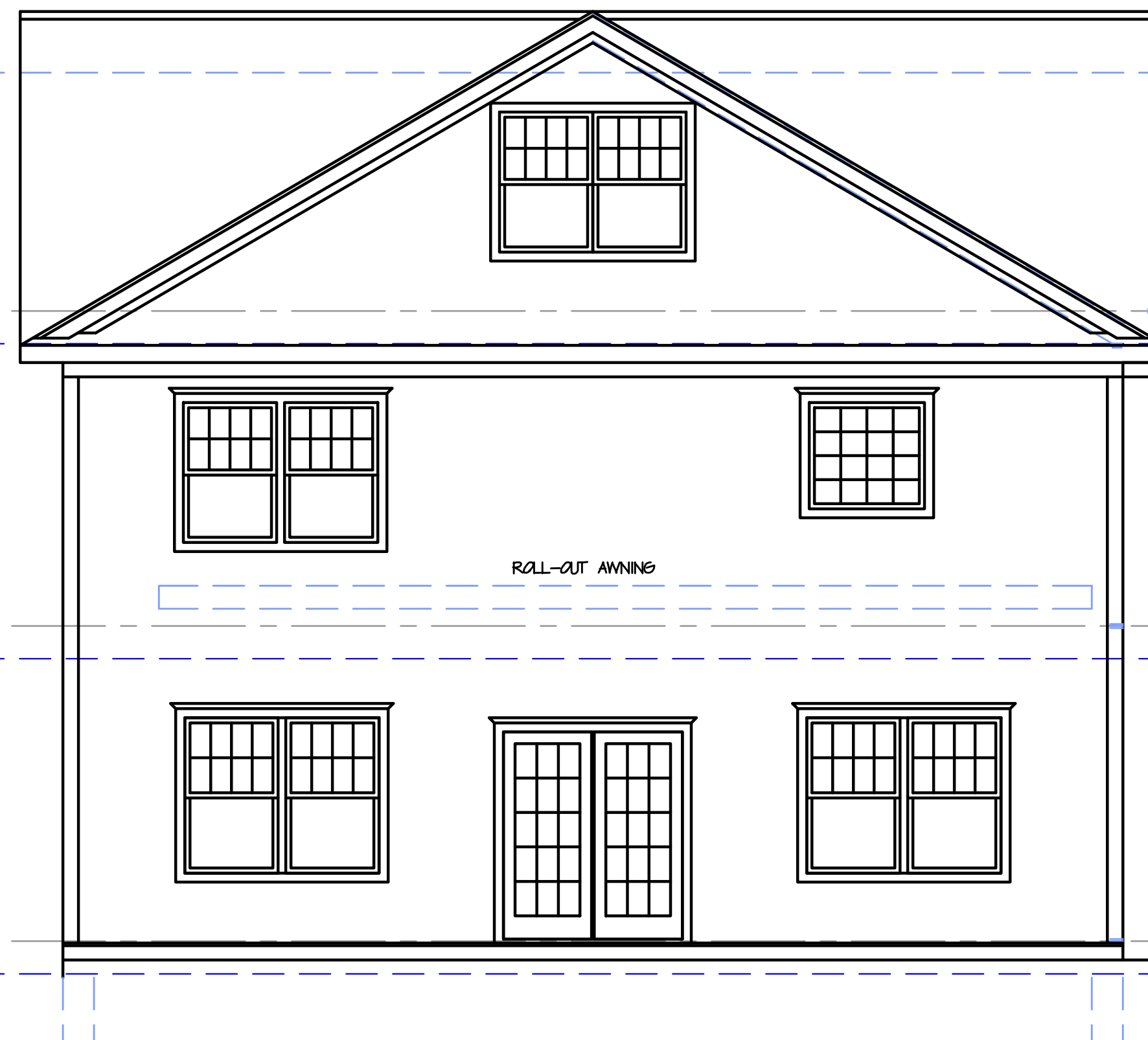
4 REAR ELEVATION SCALE: 1/4" = 1'-0"